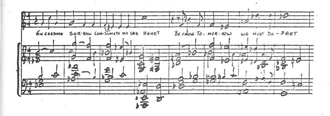
Songs of Sunset - Exceeding Sorrow

These are by no means the only devices found in Delian harmonic motion, but they are the most easily recognized.